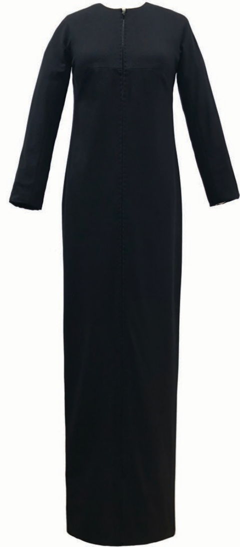
style: NA7504 - Horizontal chinchilla dolman sleeve bolero. style: NA7604 - Broadtail bolero with feather trim & jet beading. style: NA406 - Jersey gusset sleeve maxi dress, 2-way front zipper.