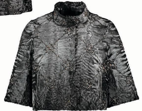
style: NA7611 - Metallic Russian broadtail coat with rhynstone embroidery. style: NA7610 - Metallic Russian broadtail short jacket with rhynstone embroidery. style: NAJ402 - Jersey double breasted long blazer. style: NAP402 - Jersey fly front trouser, pin tuck press pleates.