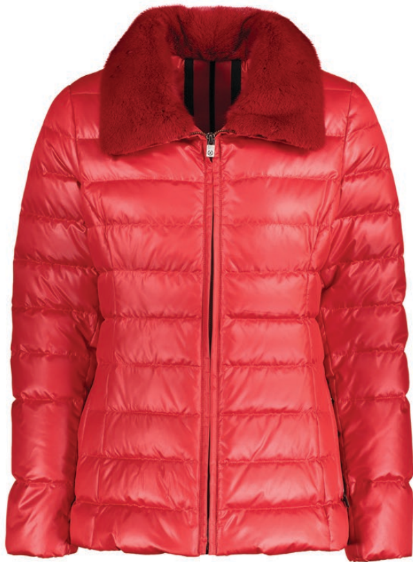
style: NA7659 - Water repellent fitted down-filled puffer jacket, mink laydown collar.