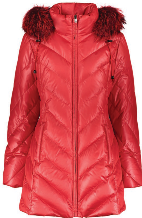
style: NA7656 - Water repellent fitted 3/4 diagonal down puffer jacket. Fox trimmed removeable hood, 2" elastic waist belt.