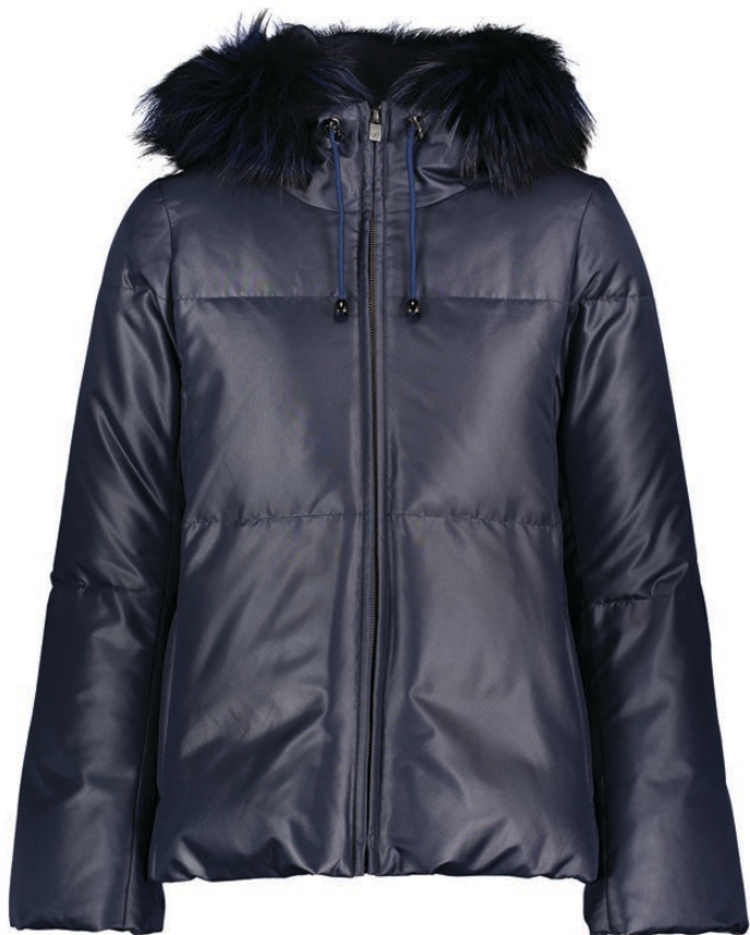
style: NA7658 - Water repellent a-line down-filled puffer jacket, detachable fox trimmed hood. style: NA400 - Jersey one piece bodysuit and balkava head cover.