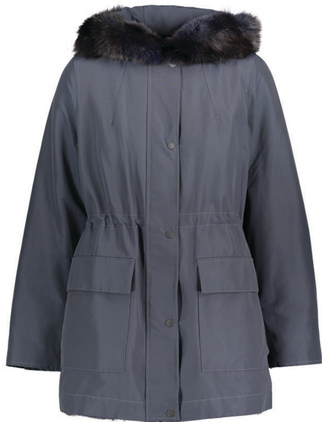
style: NA7531 - Water repellent grosgrain faille anorak raincoat. Mink lining with drawcord waist. Russian sable hood trim.