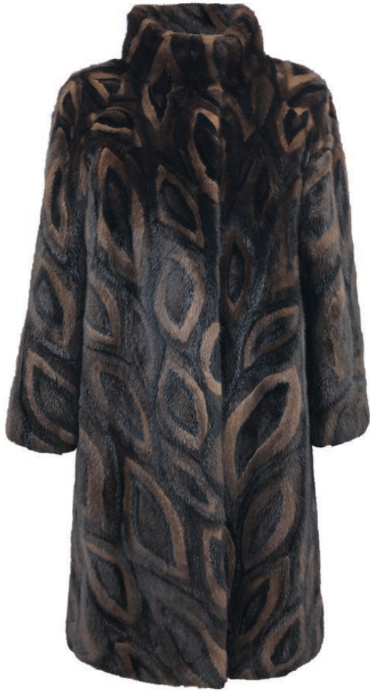
style: NA7630 - Mink intarsia 3/4 coat w. bracelet length sleeves. style: NA - Jersey one piece bodysuit and balkava head cover. style: NAB202 - 2" gloss alligator belt