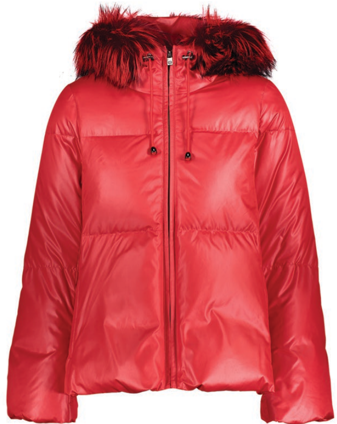
style: NA7658 - Water repellent a-line down-filled puffer jacket, detachable fox trimmed hood.